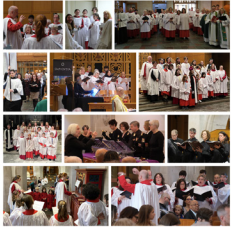
Concerts at St. Paul's 2025-2026