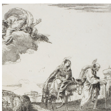
Plate eight from "The Flight into Egypt," Giovanni Domenico Tiepolo, 1753. Etching on paper.

Our youth will share stories and reflections from their summer mission trip to Boys Home of Virginia. Hear how service, community, and friendship deepened their sense of belonging with each other and with God.