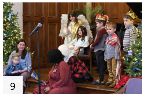
1: Youth Pilgrimage participants shared their experience during The Forum. 2: All Things Advent. 3: Christmas Pageant leads rehearsing. 4: An Advent Procession of Lessons and Carols. 5: Women's group baking casseroles for Loaves and Fishes Christmas Dinner. 6: Loaves and Fishes Christmas Dinner. 7: Greens Workshop. 8: A St. Paul's Chorister Christmas. 8: Kids help retell the Nativity story during the 2 p.m. Christmas Eve Service. (more pics throughout)