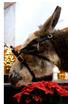
Visiting with Nativity Animals on Christmas Eve